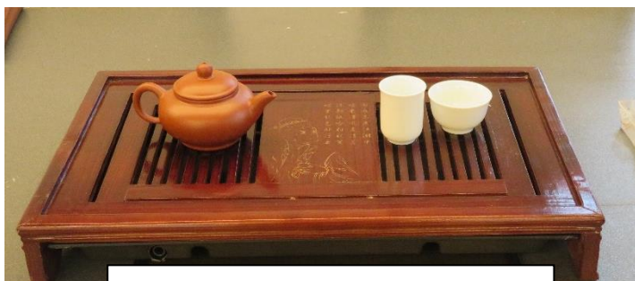
This tray shows the drain below. The first pour is always thrown out.