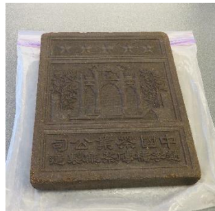
A brick of Tea showing how it is shipped