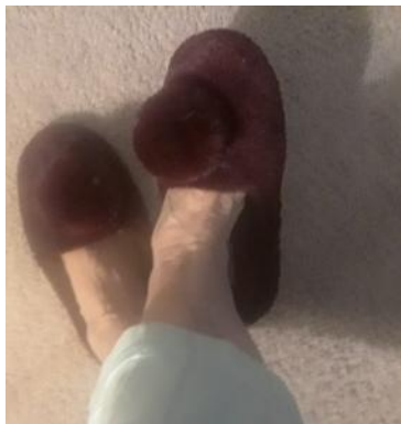
Very warm & cozy tootsies!!

Remember to send me pictures for the February newsletter... Barb sent a picture of hers already!!