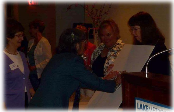
The final pieces of the GFWC puzzle are added by our co-Presidents