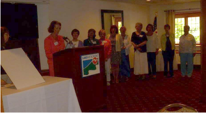
And throughout the banquet, all the pieces of the MWC puzzle enjoyed each other's company