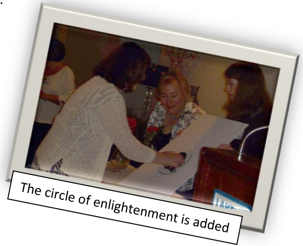
The circle of enlightenment is added