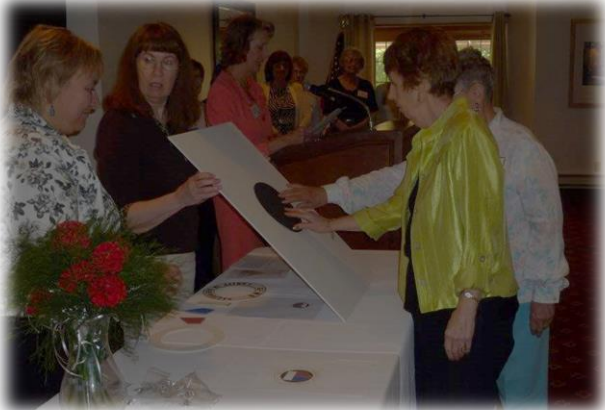
The first piece is the world before enlightenment

The Puzzle that our newly inducted officers are completing is the GFWC logo.