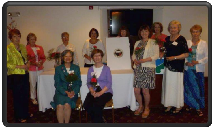
MEET OUR NEW OFFICERS FOR 2015-16