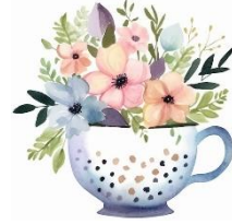
~ Diana – 4/11